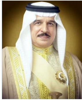
His Majesty King Hamad bin Isa Al Khalifa