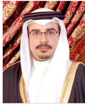
His Royal Highness, Prince Salman bin Hamad Al Khalifa

The Crown Prince, Deputy Supreme Commander and Prime Minister