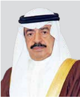
His Royal Highness, Prince Khalifa bin Salman Al Khalifa

The Prime Minister of the Kingdom of Bahrain