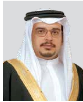
His Royal Highness, Prince Salman bin Hamad Al Khalifa

The Crown Prince, Deputy Supreme Commander and First Deputy Prime Minister of the Kingdom of Bahrain