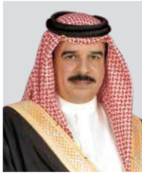
His Majesty King Hamad bin Isa Al Khalifa

The Prime Minister of the Kingdom of Bahrain